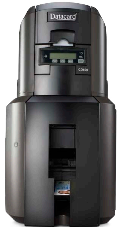
Datacard® CD800™ Card Printer with inline lamination module