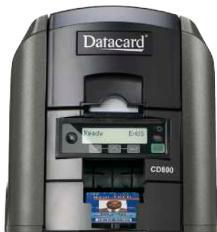
Datacard® CD800™ Series Card Printer