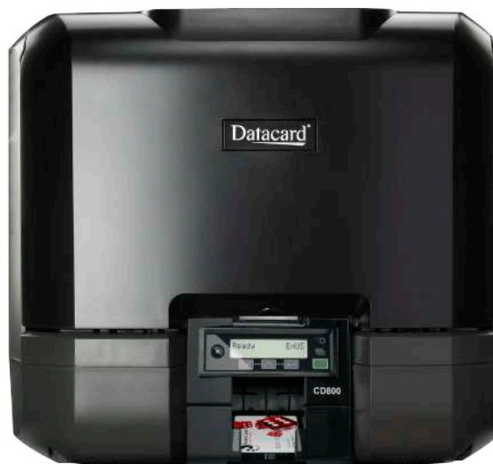
Datacard® CD800™ Card Printer with optional multi-hopper