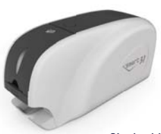
Single sided ID CARD PRINTER smart-31 S