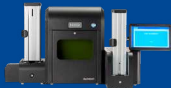
HID ELEMENT laser engraving system with single input hopper and output stacker