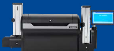
HID ELEMENT UV ink printing system with single input hopper and output stacker

With the registration and verification capabilities of HID ELEMENT's optional camera systems and supporting software integration, all applied visual data and features can be cross-checked for accuracy and precise placement — ensuring credentials are printed and/or engraved as intended and are consistent over large batch runs. Cards that do not pass verification can be sent to a secured reject bin. Individual camera systems are available for both the HID ELEMENT UV ink printing and laser engraving systems.