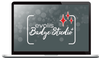
Evolis Badge Studio® card designer software