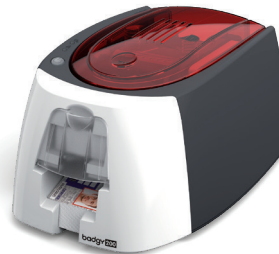
Badgy card printer