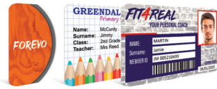
Online card template library